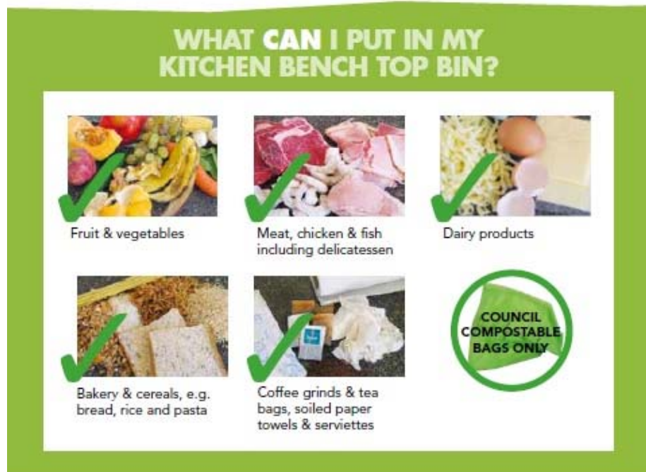
Figure: Example of updated education material