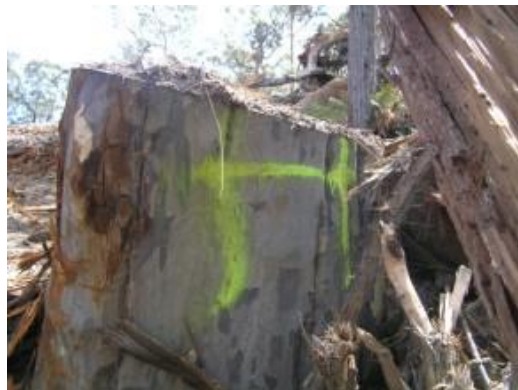
Mogo SF – Habitat Tree 'Retention'

In light of these findings, South East Forest Rescue calls for indigenous ownership of all public native forest, complete transfer of wood product reliance to the plantation timber industry and salvage recycled hardwood timber industry output, a single authority for national native forest stewardship modelled on the New Zealand example and an immediate nation-wide program of catchment remediation and native habitat re-forestation.