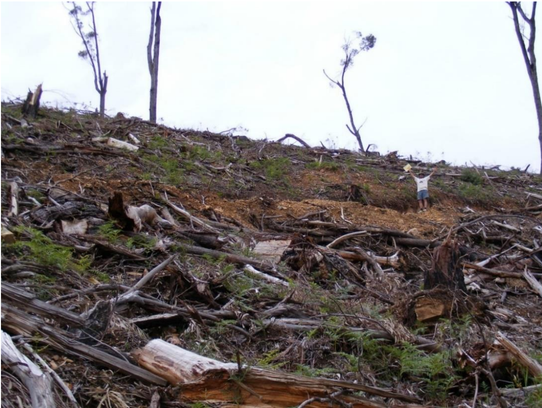
Gnupa SF – 4 trees per 2 hectares. “Gnupa was a mistake”: FCNSW

We assert that urgency is needed in this forest reform. In our view, the RFA experiment has failed.