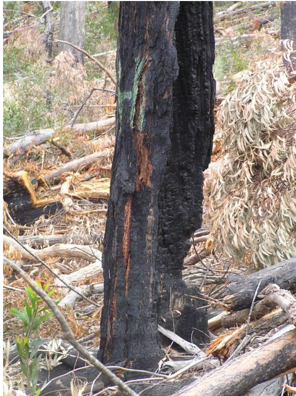
Dampier SF – ‘Habitat Tree’ retained for future generations...

The change in species composition of ecosystems due to the preferential grazing of palatable species is only one effect from grazing. Cloven-hoofed animals have contributed to soil compaction and general degradation of ecological processes by causing the loss of leaf litter and the associated loss of soil micro-organisms and available carbon, reduced soil water infiltration rates and an increase in soil erosion. 174 These effects are particularly pronounced in temperate woodlands. 175