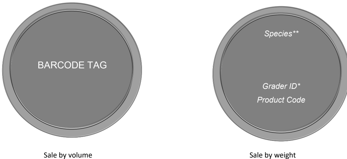
Figure 1 - Log Marking Format

Logs will be marked at the large end in the format shown in Figure 1 or Figure 2. With log products sold by volume, all log details are recorded against the tag and these details are printed on the delivery docket. Log products sold by weight do not have a Barcode tag.